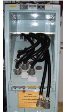
Transmitter Aerial Exchange EY

The Receive aerials consisted of three 30 foot whips for HF and a wire for LF/MF reception. All receive aerials were distributed to the receivers via a Receiver Aerial Exchange (EZ). This also contained tuneable rejection filters to remove any interference