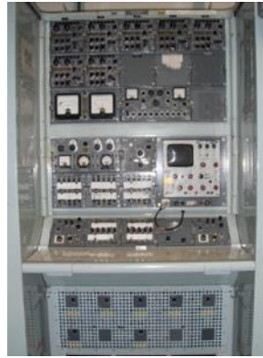
Control and Monitoring Desk

Integrated Communications System 1 (ICS1) was heralded into service around 1961. It was first fitted to the early Leander Class frigates and later to