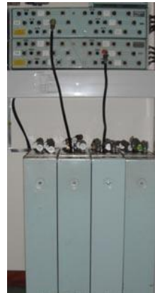
Control Communications Exchange

Once the transmitter was tuned and ready for use control could be passed to any remote radio operator's position. This was achieved via the Control Communications Exchange (CCX). The CCX consisted of upper and lower sections connected by flexible multi pin connectors, providing a very adaptable system for the remote control of any Transmitter/Receiver combination. The Transmit aerial system was made up of two base tuned HF whips and one HF filter tuned wire and one MF base tuned wire. These could be used by any transmitter via a