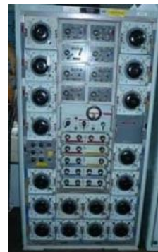
Receiver Aerial Exchange EZ

With most of the problems that existed prior to the introduction of ICS1 overcome, the system proved to be